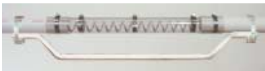
MULTIFLO® Inspection Window