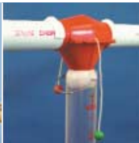
Farrowing Drop Feeder