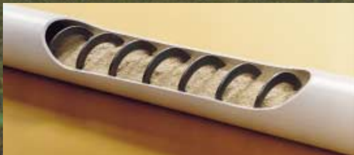
Get worry-free performance in feed conveying