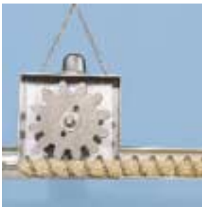
MULTIFLO® Drive Gear

For the distributor nearest you, call the Chore-Time Customer Service Department at 574-658-4101.