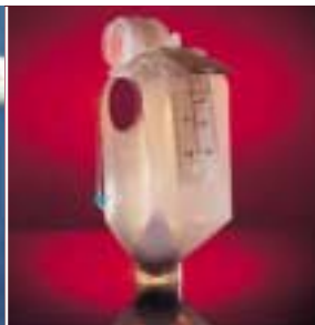
Chore-Time Sow Feeder