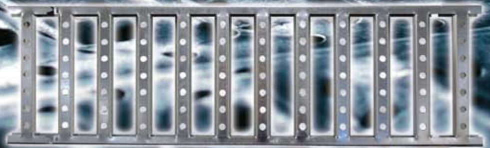
PARTHENON® Support Profile