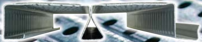
Brock TRI-CORR® Floor Profile

Featuring BROCK's Super Strong TRI-CORR® Bin Flooring and PARTHENON® Support for Bin Aeration Floor Systems